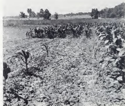
Untreated check area center to lower left; aldrin treated plot to right; and heptachlor treated area beyond center of photo.

Treat a band about 6 inches wide over the row or hills, just behind the planter shoe. Be sure that the soil closing in behind the planter shoe covers the insecticide. Do not place the insecticide directly on the seed.